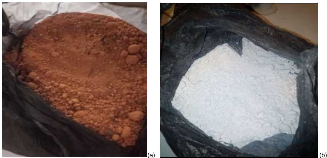
Figure 1. Partial view of: (a) red and (b) white locally available inert dusts.

unsexed experimental insects were introduced to the treated and an untreated seed in the glass jars. Then, the jars were covered with nylon mesh and held in place with rubber bands. The experiments were laid up in Completely Randomized Design (CRD) in three replications consisting of the two colored inert dusts in four rates of application. All treatments were maintained under the same laboratory conditions indicated in insect culture section. Data's were collected on: